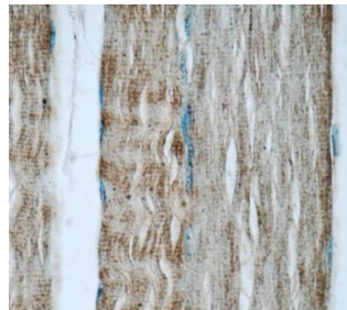
Immunohistochemistry of paraffin-embedded human skeletal muscle tissue slide using (TNNT3 Antibody) at dilution of 1:50

For Research use only IMMUNOLOGICAL SCIENCES